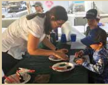
The Creole Classic Fishing Tournament and ROR joined forces for the second time to host another successful "Launch Party at Creole Classic" during their mid-summer fishing tournament in Grand Isle, LA.

ROR is putting boots on the ground, from conferences to fly-overs and everything in between!