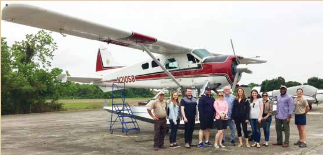
ROR welcomes Congressional Staffers to coastal Louisiana with a first-hand look into successful diversion benefits with an airboat tour of Davis Pond and a look at the effects of land loss by a seaplane fly-over of our coast.